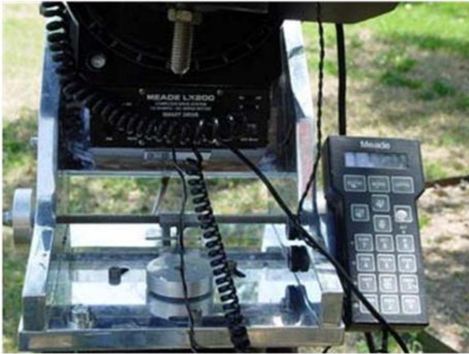
Picture 4: Top view of the wedge and front view of the control panel for the LX200

Long exposure astrophotography requires owning a telescope with good motors for tracking objects in declination and right ascension that you're imaging. Counterbalancing with weights helps the drive motors operate smoothly when doing so. The LX200 has decent motors on both axes and an easy to use computerized program for finding objects in space, once the telescope is aligned. That package includes a user-friendly hand controller for operating the scope.