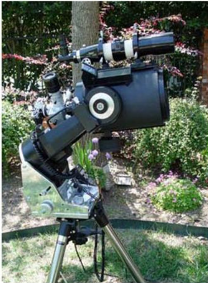
Picture1: Basic Setup

All of the pictures presented in this site were taken with an 8-inch aperture Schmidt-Cassegrain telescope (LX200). I bought this scope because of its versatility. The aperture is adequate for both visual and photographic work and it has an electronic program for locating objects in space. The cost of the basic scope was also relatively cheap (about $2,500 today). I spent much more than that, however, buying the right equipment for use in the field. Astrophotography is an expensive (and time consuming) hobby. The following discussion gives a brief overview of what was involved in taking the pictures shown on this site.